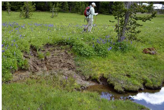
Gotchen Creek bank erosion caused by trespass cows, GM 3, 8/19/11