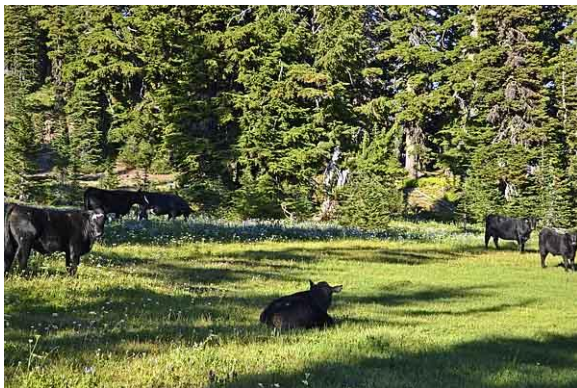
Trespass cows in GM 1b and in closed Mt. Adams Wilderness, 9/14/11