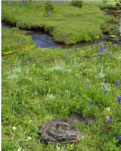
Cow pie next to Gotchen Creek GM 3, 8/19/11