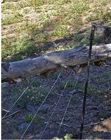
Tree on fence