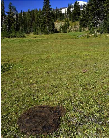
Cow pie in fragile GM 1b, 9/29/11