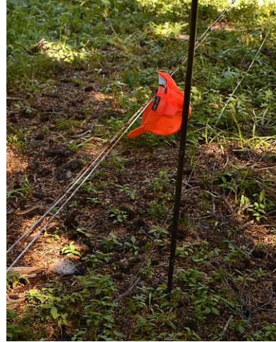
Space large enough for calf to pass